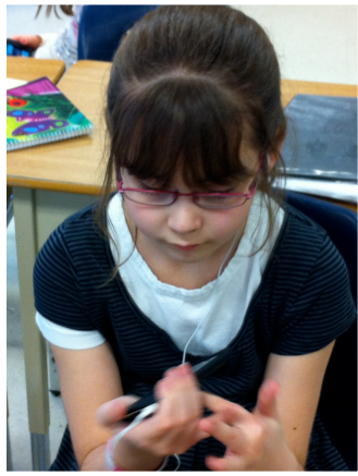
Listen to Reading: Literacy Centre