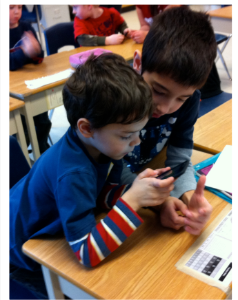
Word Work Grade 3 & K