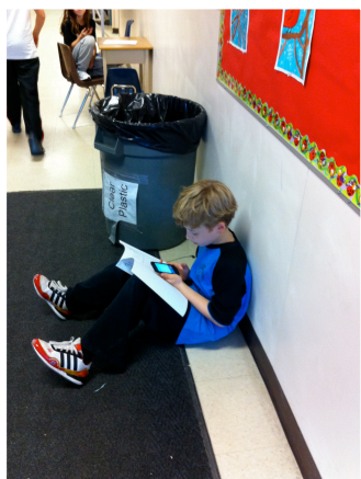
Recording a Voice Memo