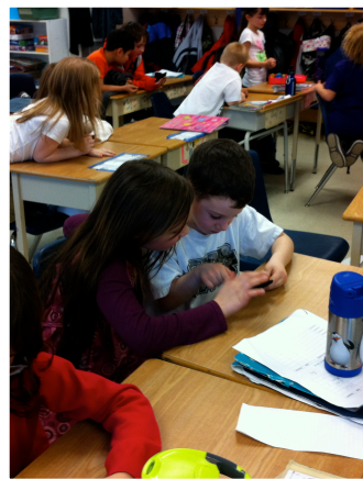
Word Bingo Grade 3 & K