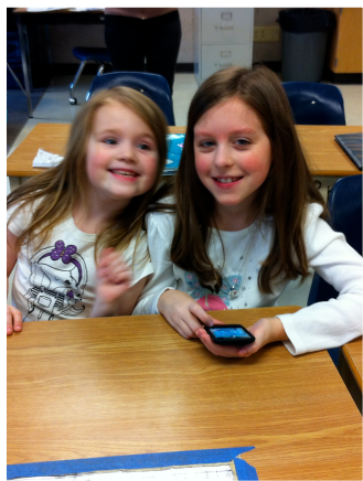
With our buddy class